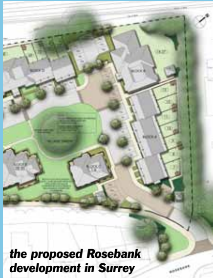
the proposed Rosebank development in Surrey